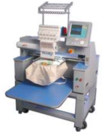
Prodigi 12 Needle

If for example you have a dedicated embroidery room on a ground floor with easy access, a larger machine such as the Prodigy 12 needle would be wonderful. The weight is over 200kg but that would not be of concern.