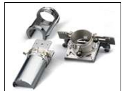
Optional Cylinder Frame Set

An exciting new addition to the Brother PR620 is the inclusion of the all new Cylinder Frame Set. The cylinder frame set allows you to stitch fashion and logo embroidery on long narrow jeans or pant legs, sleeves and other locations with ease. Again this is almost impossible on conventional machines without unpicking seams.