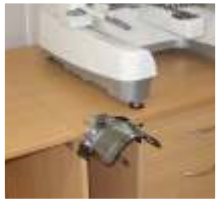
Unique Hooping Platform