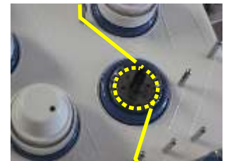
Closer view with the dial and spring removed. Note how the thread travels around the spinning wheel

There are basically two ways to apply tension to thread, the first and most common approach for Home Style Embroidery machines is what is called a compression tension. In other words, the thread will pass between two metal disks that are pressed together by an adjustable compression spring. This applies tension directly to the thread itself and is a system that dates back to the 1800’s. Almost all sewing machines use this type of tension device, which is fine as a reasonably tight tension is needed for traditional sewing.