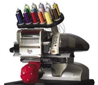
Melco Amaya16 Needle

Multi needle embroidery machines have been available for decades but it is the recent change in pricing and affordability that has stirred all the interest. The obvious benefit of a multi needle machine is that you will spend less time changing threads but in reality the benefits go much further than convenience.