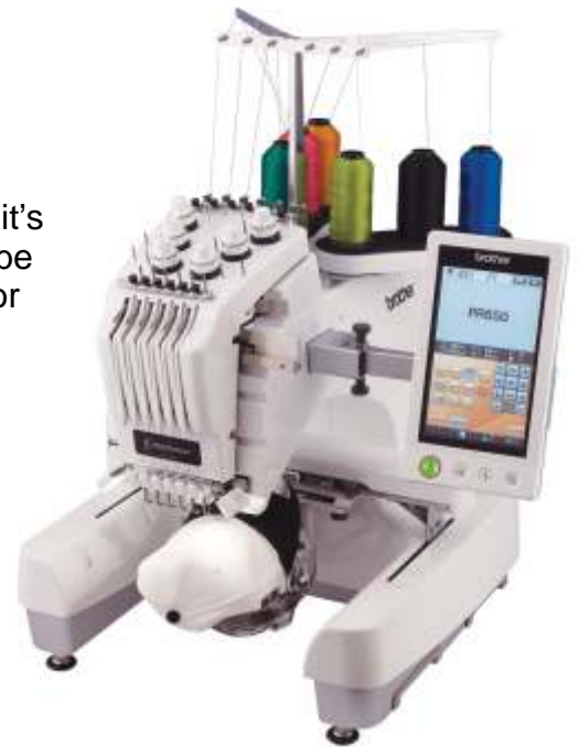
Cap Hoop and Driver for Brother PR650 offers a 130mm x 60mm Cap sewing field

The Melco Amaya features a large 362mm x 82mm Cap sewing field and allows for embroidery on pockets and socks etc.