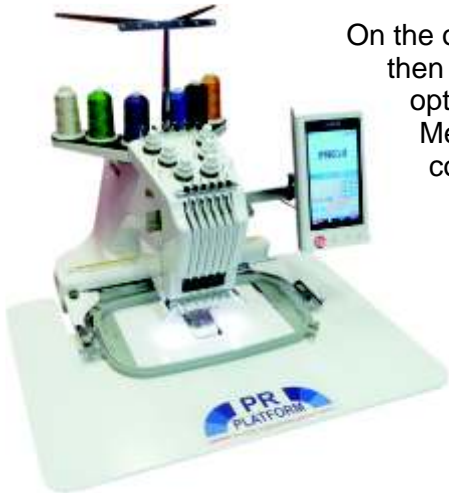
Brother PR650 with PR Platform Included. Standard inclusion from Echidna

On the other hand, if portability and or space is a concern then the compact Brother PR650 with 6 needles is a logical option. The weight is only 37kg. You could also consider the Melco Amaya16 Needle which is also quite compact yet offers full commercial viability.