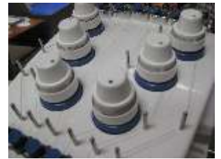
Sample of spinning tension system on a Brother PR620